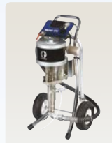
Mercur™ X48 / X72