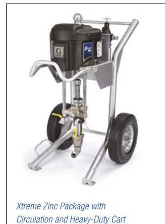
Xtreme Zinc Package with Circulation and Heavy-Duty Cart